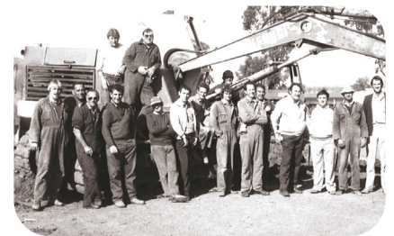
BELOW: Staff working on the Bulgary scheme in the 1980s.

utility, providing safe and reliable drinking water to more than 77,000 people across 15,000 square kilometres.