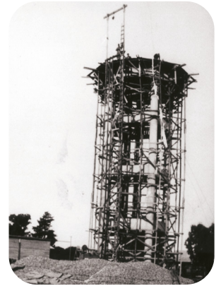
ABOVE: Boree Creek reservoir construction in 1951.