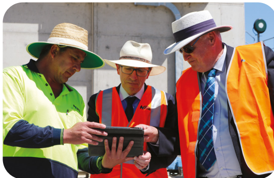
BELOW LEFT: Switching on the new Water Treatment plant in 2021.